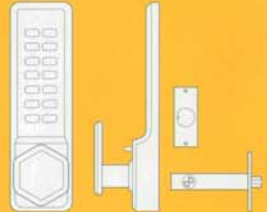
■ Mortice latch with hold-open feature