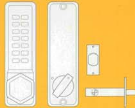
■ Mortice deadbolt