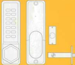
■ Mortice latch