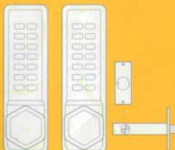
■ Back to back mortice latch